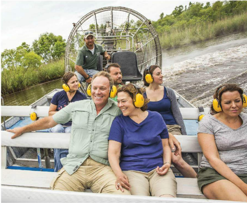
Air boats take visitors on tours of the wetlands on the Mississippi Gulf Coast.