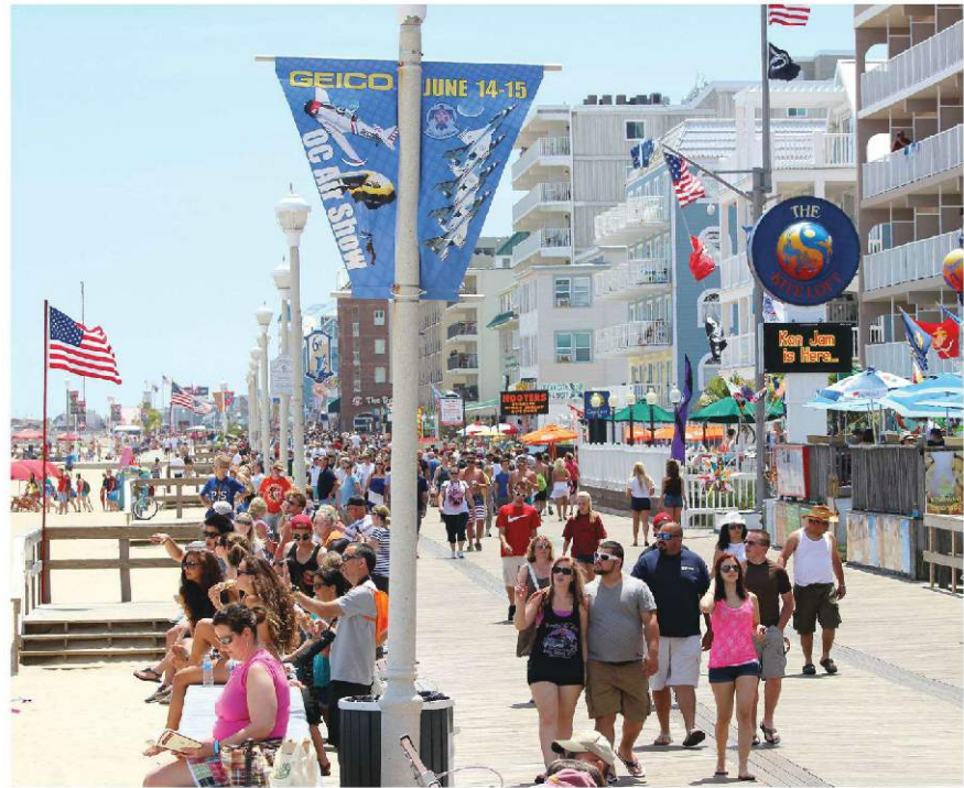
The Ocean City boardwalk hums with activity.

On the Atlantic Ocean side, attendees will find 10 miles of beach and the city's three-mile-long boardwalk, which is a favorite